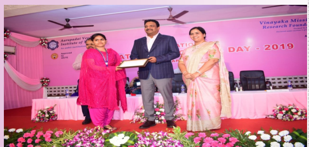
OUTSTANDING STUDENT AWARD