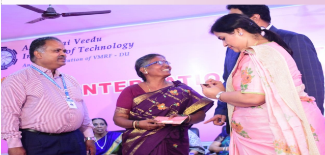
EXCEPTIONAL MOTHER AWARD