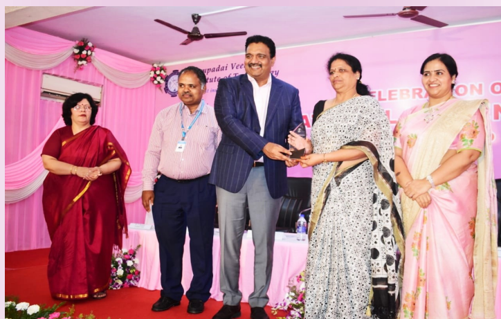
Mrs.VANITHA,IPS, JOINT COMMISIONER,CHENNAI - COMMUNITY AND SER- VICES AND WOMEN EMPOWERMENT