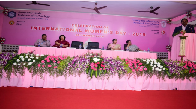
ADDRESS – HONOURABLE CHANCELLOR